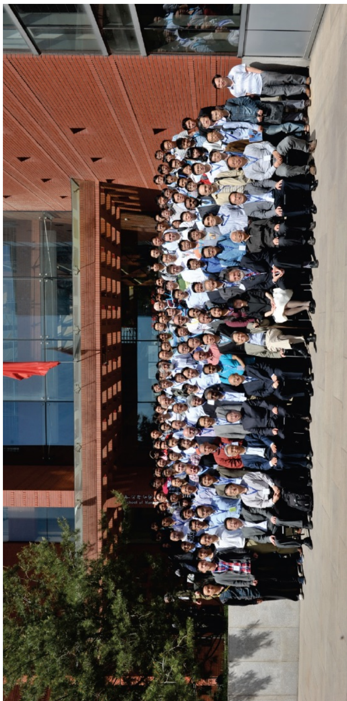
Fig. 2 The group photo for the GX4 Meeting (C.N. Yang and his wife at center of first row).