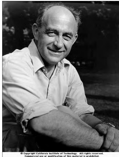
Fig. 6 Enrico Fermi (1901–1954).