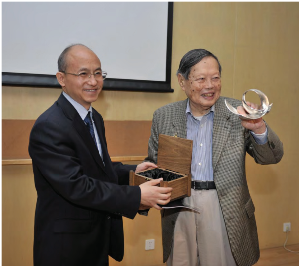
Fig. 5 C.N. Yang receiving the Marcel Grossmann Award in Beijing at the GX4 in 2015.