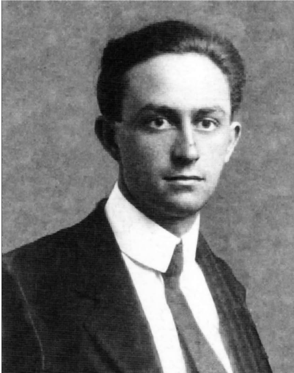
Fig. 1 The young Enrico fermi.