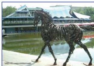
The Iron Horse, contemporary artist